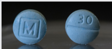
*Counterfeit oxycodone M30 tablets containing fentanyl