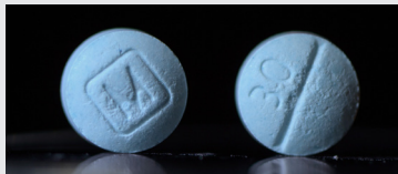
Authentic oxycodone M30 tablets